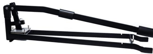
3. Optional; Flip handle

Optional; to make the crushing processes easier; you may remove the long handle and flip it over. This will put the end of the handle lower and in a comfortable position for crushing. (See pic 3)