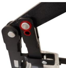
1. Position spike in lower holes

First, raise the spike by removing the clevis pin and position it on the lower set of holes. (1) This will allow the Waffler to fit into the tray of the Crusher. Next, insert Waffler into the tray of the Crusher. (2)