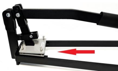
2. Insert Waffler into tray